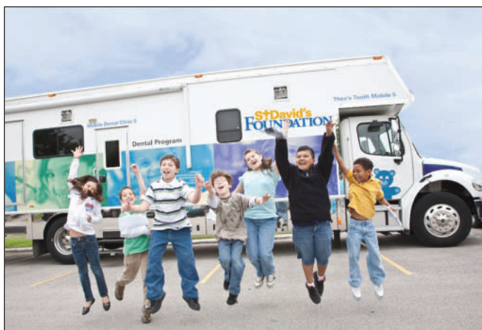
St. David's Dental Program, a St. David's Foundation-operated fleet of six mobile dental vans, treated more than 6,000 children at school and adults at safety-net clinics in 2010.

our anticipated population growth, we will need many more health care workers, and providing world-class educational opportunities is a wise investment in our region's future.